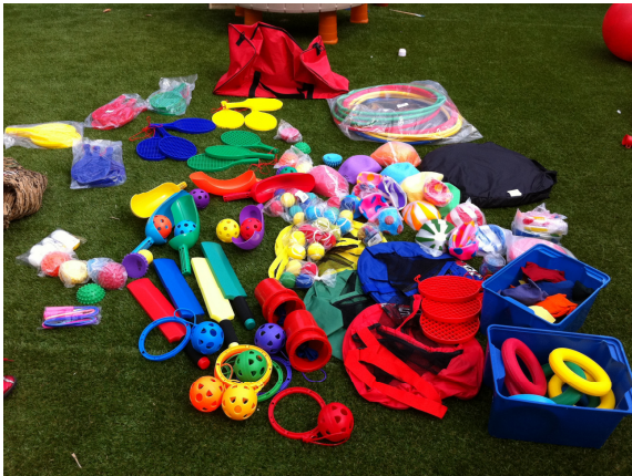
The equipment we got using the Sainsbury's vouchers last year ...

We were very grateful for your support in collecting these tokens and hopefully if the offer runs again this year we can beat last year's collection total.