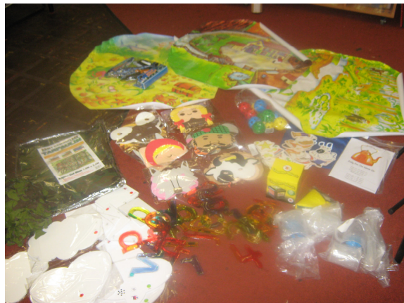
... and this is what we got using the vouchers from Tesco's.